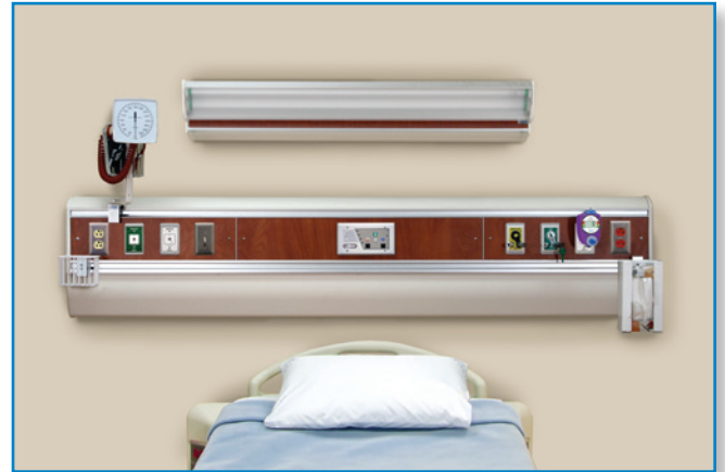
Figure 1. Majestic Series Single Tier Headwall System

The Amico Majestic Series Single Tier Headwall shall be manufactured by Amico Corporation, in accordance with job specific shop drawings and documents. The complete Headwall assembly shall be cULus listed. The following is a general specification, and components listed may not be present or required in final product.