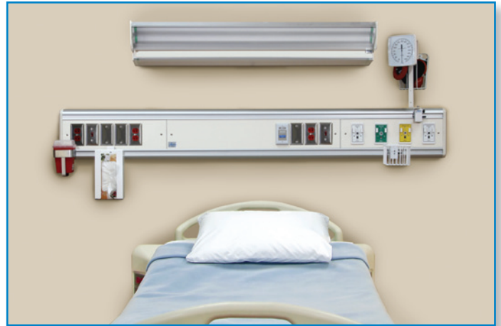
Figure 1. Majestic Series Recessed Single Tier Headwall System

The Amico Majestic Series Recessed Single Tier Headwall shall be manufactured by Amico Corporation, in accordance with job specific shop drawings and documents. The complete Headwall assembly shall be cULus listed. The following is a general specification, and components listed may not be present or required in final product.