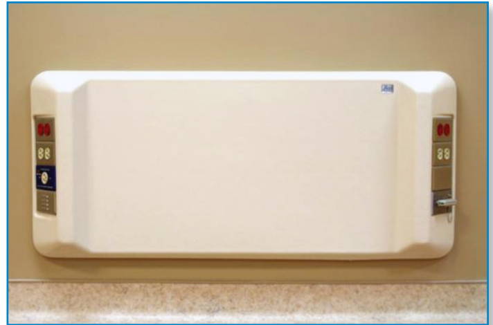
Figure 1. Amico Bed Locator System

The Amico Bed Locator shall be manufactured by Amico Corporation, in accordance with job specific shop drawings and documents. The complete Bed Locator assembly shall be cULus listed. The following is a general specification, and components listed may not be present or required in final product.