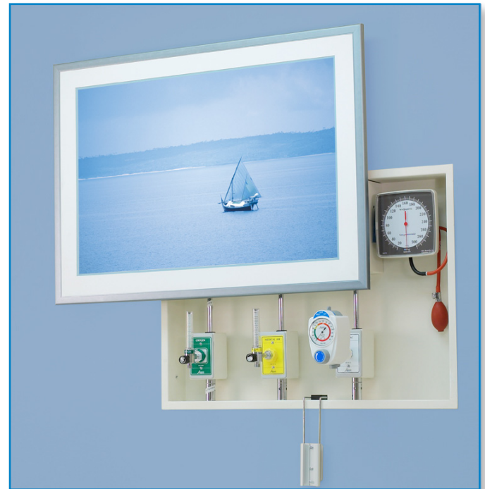
Figure 1. Reflection Series Artwalls

The installation contractor is responsible for compliance with all local, state, and federal codes applicable to the installation of medical gas and electrical systems.