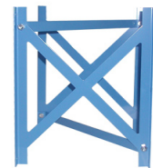
Amico X-Bracket Stand Model # M-X-MAN-SUP

The Amico X-Bracket Stand is still available as an option for mounting the manifolds directly on the wall.